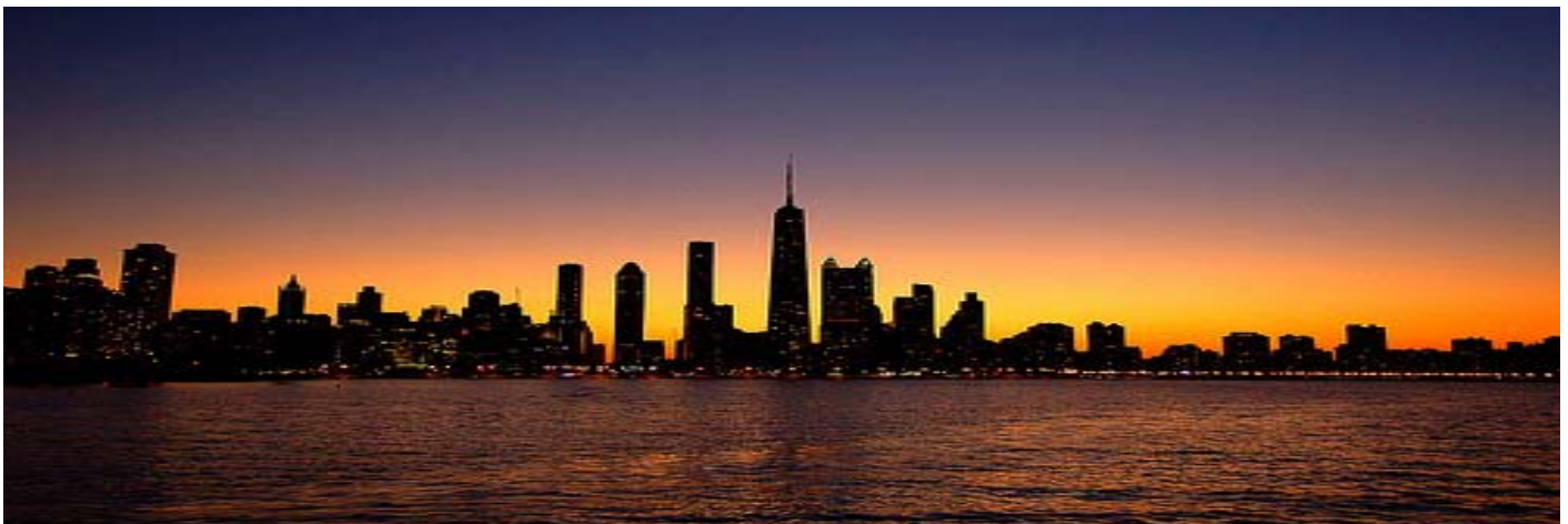
Lake Michigan Shoreline

The ASCLS-NJ Delegation worked hard, and most important, represented YOU, the ASCLS members of New Jersey. The society extends a “Thank You” and their appreciation to all the delegates who offered their time, talent, energies, and resources to represent New Jersey at this meeting.