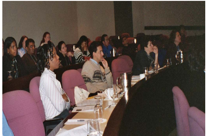
No fooling around for the registrants attending the NJSCLS Spring Seminar held on April 1, 2004