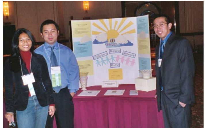
Student Forum Committee members raising funds for the Children's Miracle Network

The presentations included a lively question and answer session with the students and presenters. The presentations were very informative and the students were pleased that they could interact with each other and learn from these presentations before graduation and heading out into the work world.