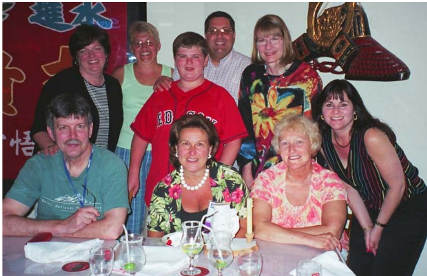
Representatives from ASCLS-NJ

In addition to gaining new knowledge at these sessions, the ASCLS-NJ delegation had responsibilities to attend various governance meetings throughout the week. These included sessions on licensure, students forum, issues updates, scientific assembly meetings, two sessions of the House of Delegates, president and president-elect seminars, leadership and membership development, official voting, and more. The ASCLS-NJ delegation